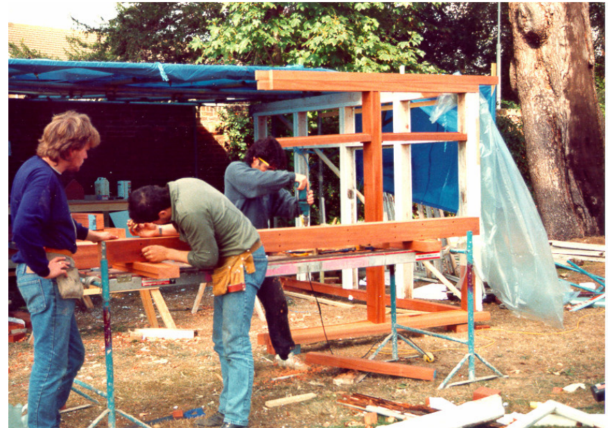
Work on Site

Funding Source: Private Const Value: £170,950 Main Contractor: Asheville Construction Ltd Consultants: SE: Alan Baxter & Associates