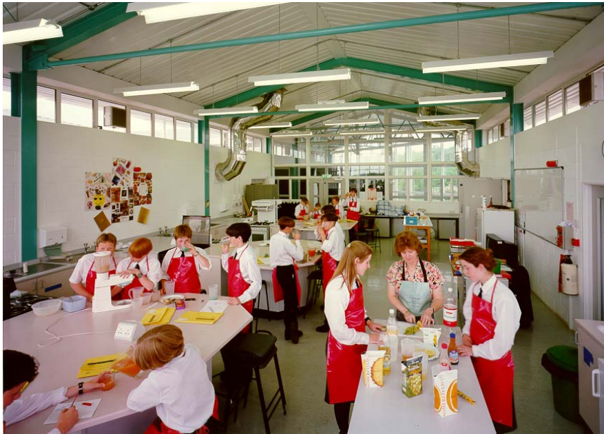
Food Technology Room