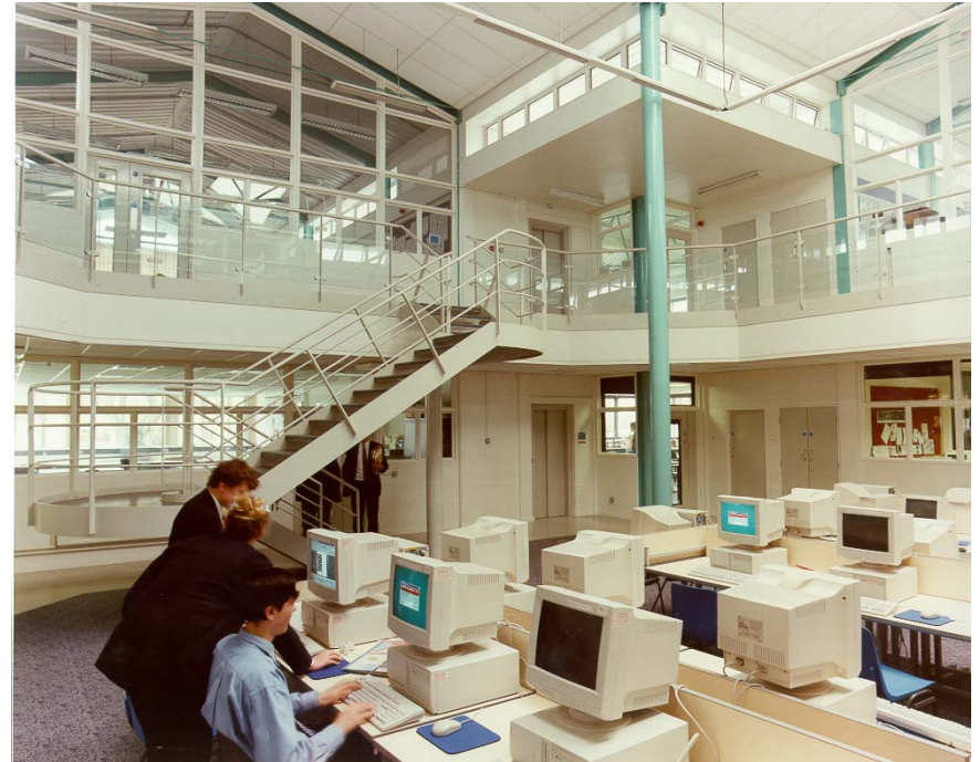
Central Resource Area

Funding Source: FAS / School Const Value: £2.3million Main Contractor: John Youngs Ltd, Norwich Consultants: QS: Mellish & Lynch SE: Mansfield Associates Services: Norfolk Property Services