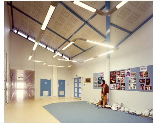
Entrance and Resource Area

The Drama classroom forms the focal point, between the English and History Departments, to the New Humanities Building. Although it is shaped like an amphitheatre, it has been designed as a flexible 'black box' to accommodate performances in a number of configurations, either against a back wall or in the round. State-of-the-art lighting and sound controls have been carefully integrated into the design.